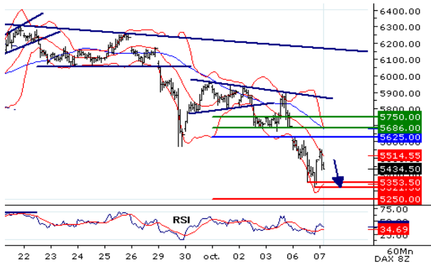
Daily bar chart (20/50 day MA, Bollinger band and MACD)